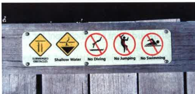
Hot Spot Capping Plates - 25/02/2010