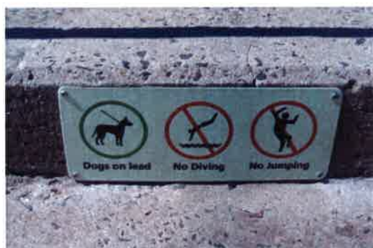
Entrance Capping Plates - 25/02/2010