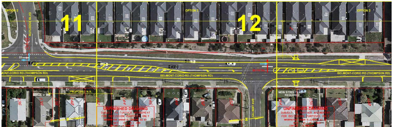
1. Image 1 – Concept of proposed changes to Thompson Road, in the vicinity of the fatal incident.