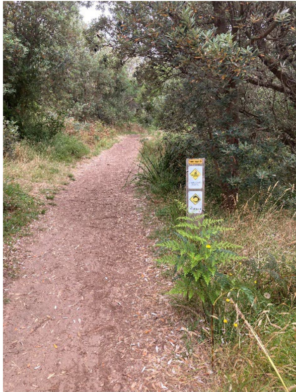
Figure 4 & 5: Risk signage at the Cape Schanck entrance to the Bushrangers Bay walking track and the Risk signage on Bushrangers Bay walking track