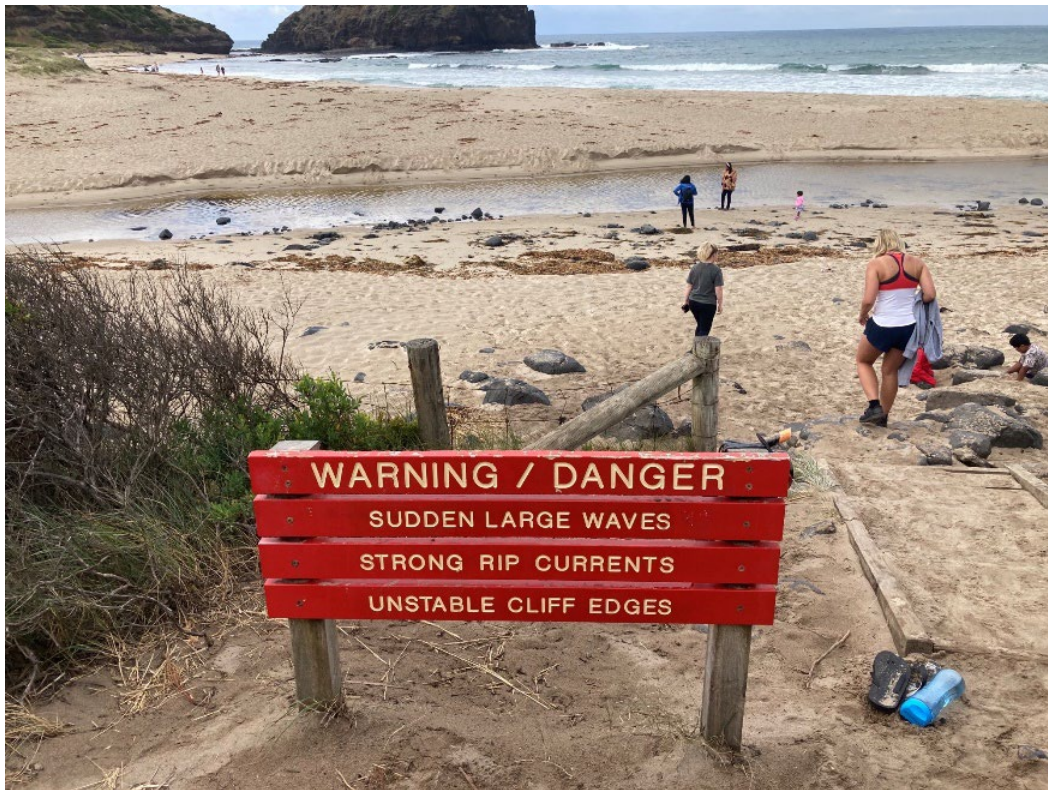
Figure 7: Risk signage at the end of the Bushrangers Bay walking track

In addition to the existing signage, Parks Victoria will place a risk totem with matching hazard symbols adjacent to the red sign installed on entry to the beach at Bushrangers Bay.