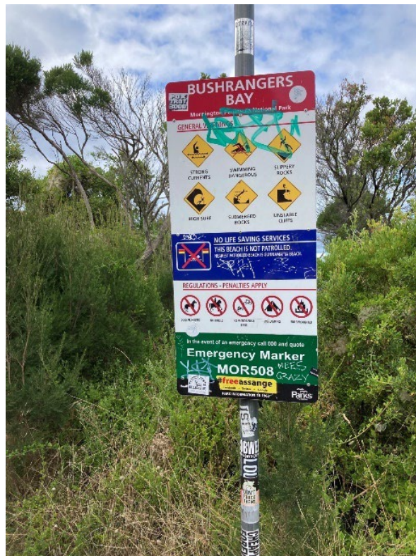
Figure 6: Risk signage at the track junction leading to Bushrangers Bay beach