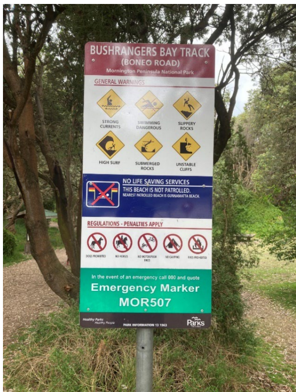
Figures 2 & 3: Risk signage at the Boneo Road entrance to the Bushrangers Bay walking track